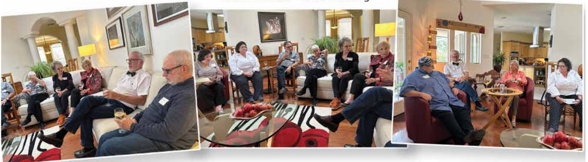
Leadership of The Jewish Community Foundation of El Paso launched Generations Day and the celebration of 20 years with all of its community partners