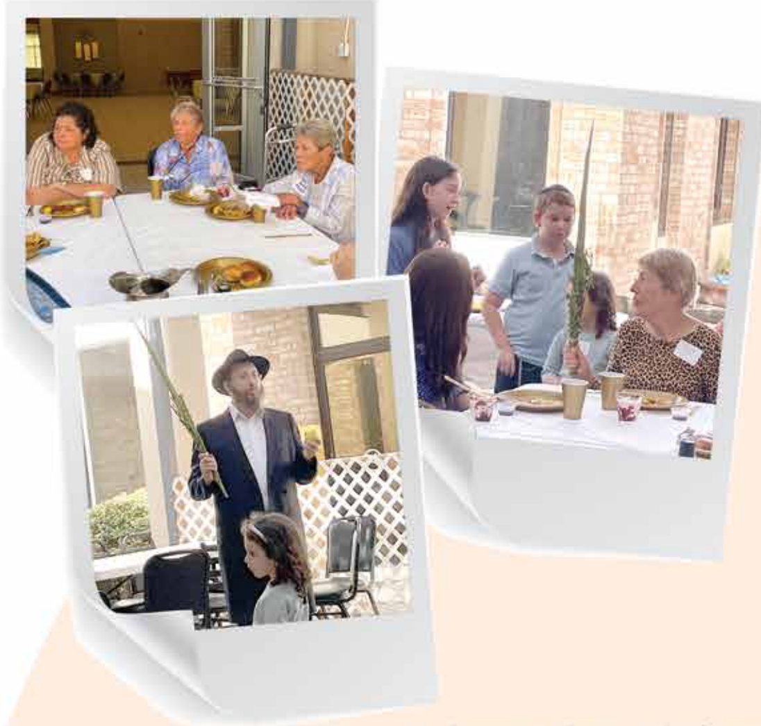
Lions of Judah - Coffee & Conversation