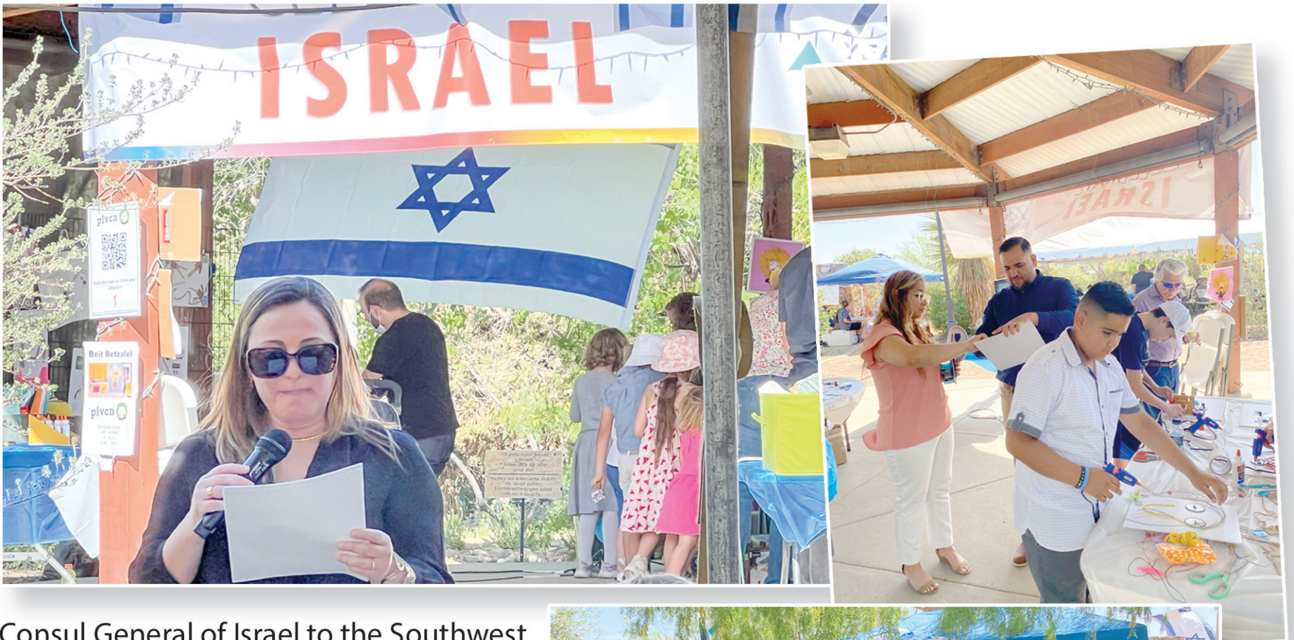
Consul General of Israel to the Southwest, Livia Link-Raviv shares a few words @ Celebrate Israel @ 74