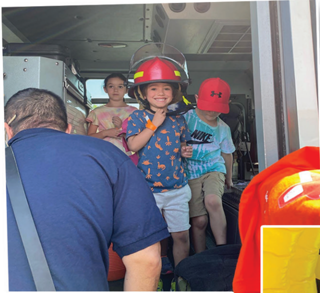
Touch a Truck - The Cherry Hill School