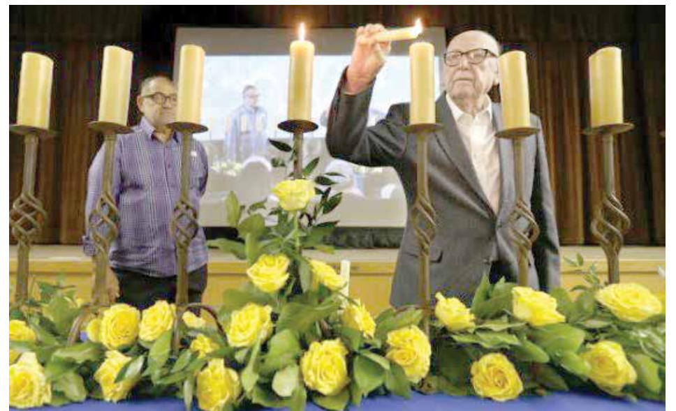
during the 2018 EPHM Yom HaShoah, Holocaust Days of Remembrance, at Congregation B'Nai Zion