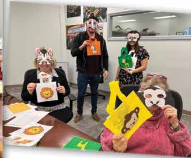
L'Chaim- to Living! committee and volunteers packaging tickets and prizes.