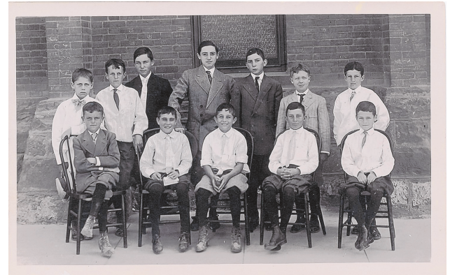
Mt. Sinai Religious School, circa 1900.