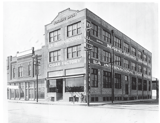
Kohlberg Bros. Cigar Factory is part of "People of the Crossing" documentary.

both sides of the border, employing many Mexican Americans, and the first to hire African American clerks."