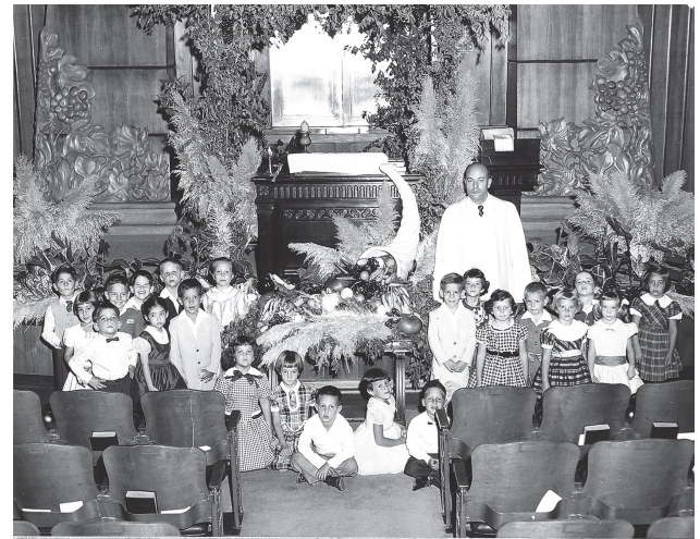
A photo of Mt. Sinai in El Paso.